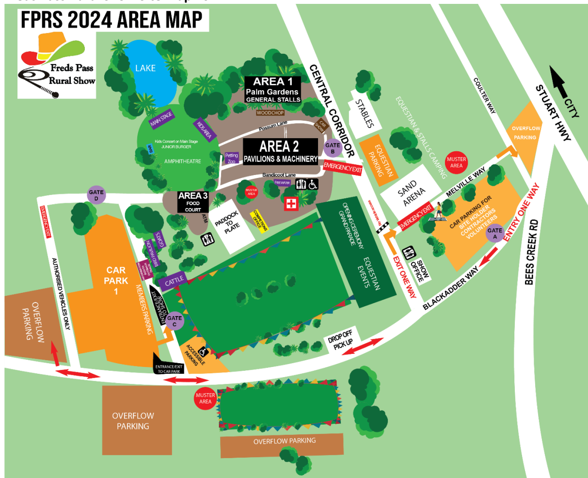
Freds Pass Rural Show Site Map 2024