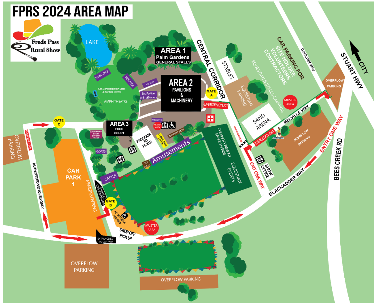
Freds Pass Rural Show Site Map 2024